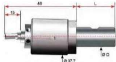
SWISS STYLE HOLDER

AUTOMOTIVE, AIRCRAFT, AEROSPACE, ELECTRONICS, MILITARY, FIREARMS, AMMUNITIONS, PLASTICS, COMMUNICATION SYSTEMS, MEDICAL, ORTHOPEDIC & DENTAL INDUSTRIES!